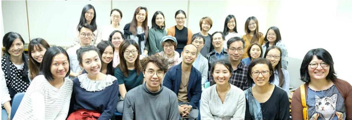
Members of HKMTA