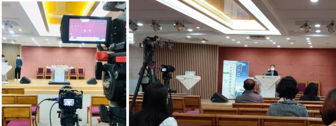
21st NAKMT Online Conference

promoting music therapy as trauma care was in align with the national movement to expand its National Trauma Centers and its training and care programs.