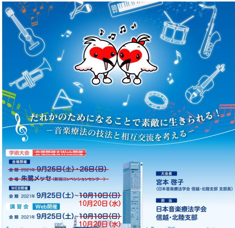
21 th JMTA Conference Information

The 21st annual conference of JMTA is currently in progress online. Attendees can access online seminars/presentations from September 25th to October 20th. I will upload news from this vibrant conference shortly!