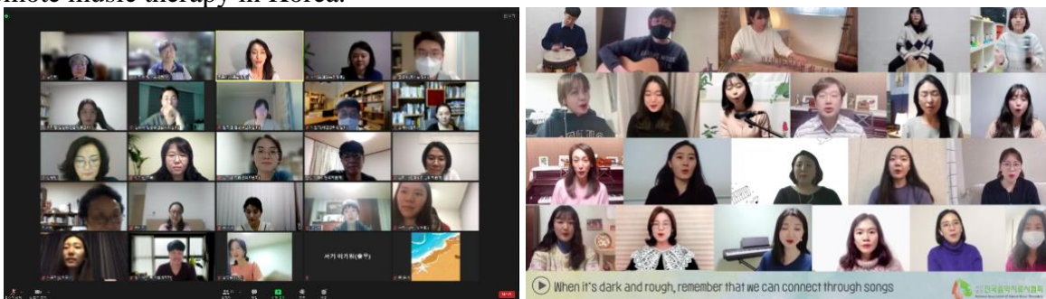
Online Meetings and Online Virtual Choir on Zoom

The National Association of Korean Music Therapists (NAKMT) embarked on numerous projects to provide quality educational and networking opportunities for its members and promote music therapy in Korea.